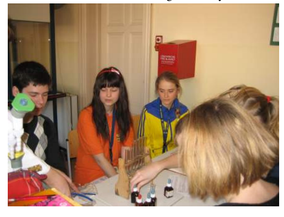
Fig. chemistry in schools