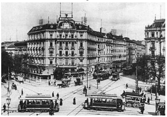
Fig. Potsdamer Platz in 1903

As was the case in most of Berlin, almost all of the buildings around Potsdamer Platz were destroyed by air raids and heavy artillery bombardment during the last years of World War II.