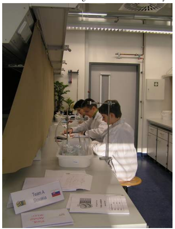
Fig. Students at the laboratory

had to solve several scientific tasks in only four hours, biologists, chemists and physicists working