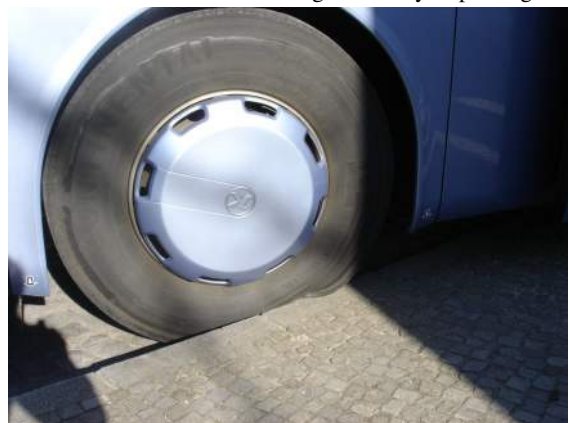
Fig. New way of parking

Parking in even the narrowest spaces – no problem ... parking on a nearly empty street – big problem.