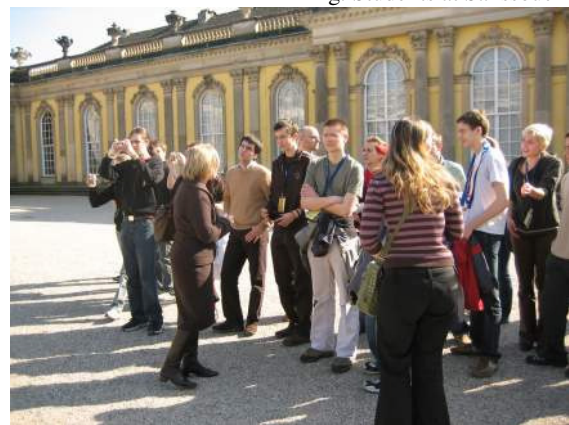
Fig. Students at Sanssouci

which ends with the Brandenburg Gate, the Catholic Peter and Paul Cathedral and the Russian military cemetery. Here the tour guides explained the different epochs of Potsdam's history: the 30 Years War, after which the city was repopulated by the Huguenots, the