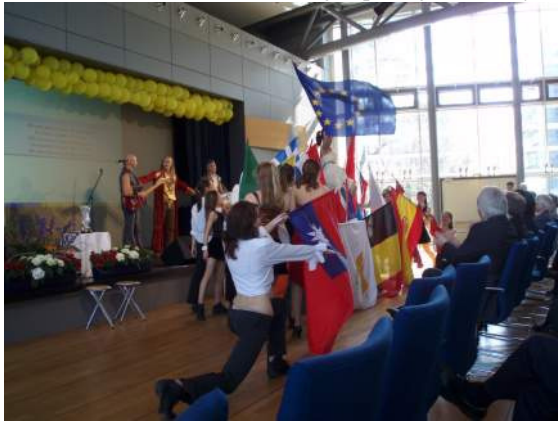
Fig. Opening Ceremony

We also had a very famous visitor at the ceremony, namely Albert Einstein, who found out that being together with a girl you love for one hour just seems like a minute while putting your hand on a stove for a minute seems like an hour. And this he called the Theory of Relativity. His humorous speech was loved by the audience, not only because of his jokes but also because he wished the participants good luck and success for the competition.