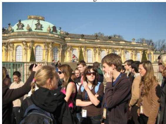
Fig. Students at Sanssouci

The major part of the students participated in a volleyball competition. The six teams consisted of students from all the different nations who then played against and also next to each other. The others had the possibility to play skittle, pool or work out in the fitness area. All in all it was a nice day where everyone got to know each other